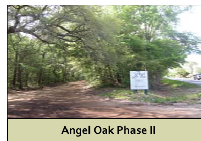
Angel Oak Phase II

Gillespie Tract - The Town of Hollywood was awarded $1.48 million to purchase 211 acres that will be used as an equestrian park and gathering place for town/community events such as tractor pulls, car shows and festivals.