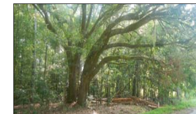
Full Faith Ministries Park

ground Preservation Society to purchase 1.1 acres in Hollywood to protect the Civil War battery known as Church Flats. Located along the Stono River, this property is planned as an interpretative park with access to the Stono River.