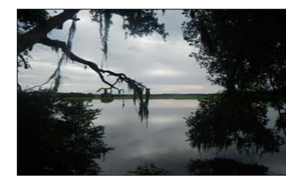
Church Flats Battery

Angel Oak Phase II - The Lowcountry Open Land Trust was awarded $2.4 million to purchase 17 acres adjacent to the Angel Oak Park on Johns Island.