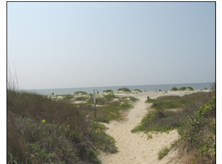
Town of Sullivan's Island Urban Greenbelt Project.

City of Charleston purchased 6.5 acres of land around the Angel Oak in order to enlarge the park and move vehicle traffic away from the tree.