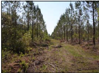
Jefferson Tract provided 292 acres for a park in Awendaw.