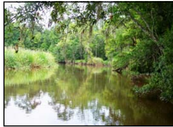
Hampton Plantation protected 488 acres of wetlands (1,124 total) along the Santee River.