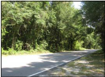
Millbrook Plantation protected 21 acres along scenic Highway 61.