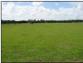
Charleston Area Therapeutic Riding protected 37 acres on Johns Island.