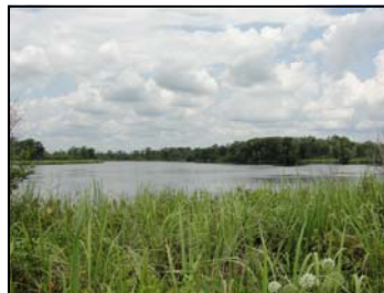
Hermitage Plantation protected 468 wetland acres (1,068 total) along the Edisto River.