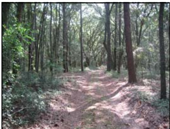
Hastings-Governor's Bluff protected 140 acres on Edisto Island.