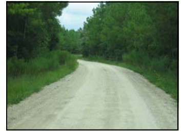
Oak Hill Farm added 64 acres to the Francis Marion National Forest.